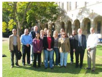
Participants in the Marine Environment and Pollution Law Course in July 2004