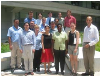
Participants in the Law of the Sea Course in February 2004