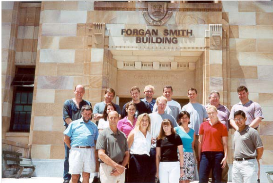
Class of February 2001: Admiralty Jurisdiction and Practice Course.