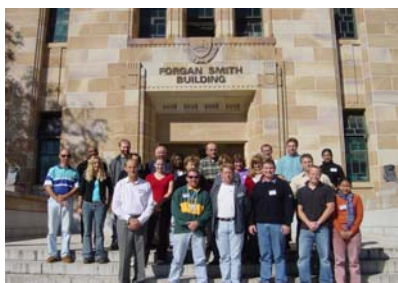
Participants in the Marine Environment and Pollution Law Course in July 2003