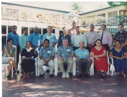
Participants in the Marine Environment & Pollution Law Course held in Fiji in June 2003