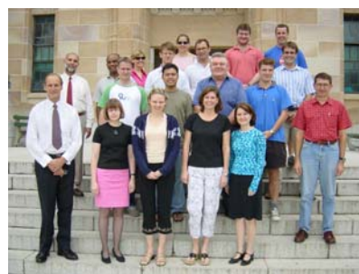
Participants in the Sea Carriage Law course in February 2003

The postgraduate 'Sea Carriage' course covered the finer points of contracts of affreightment for transport of goods by sea including bills of lading, charterparties and an introduction to the arbitral proceedings used to resolve disputes arising under such contracts. It was held from the 25 th -28 th of February and co-ordinated by Sarah Derrington.