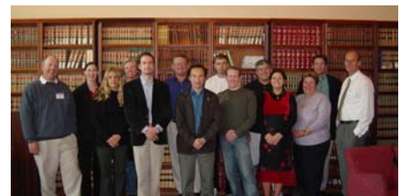
Participants in the Marine Environment and Pollution Law Course in July 2005